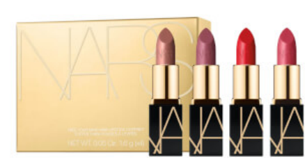
NARS MINI LIPSTICK COFFRET (WORTH £40.00)