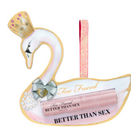
TOO FACED BETTER THAN SEX MASCARA ORNAMENT