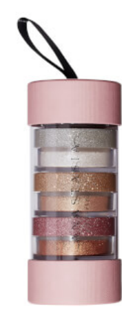
ANASTASIA BEVERLY HILLS MINI LOOSE HIGHLIGHTER SET