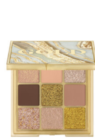
HUDA BEAUTY GOLD OBSESSIONS PALETTE