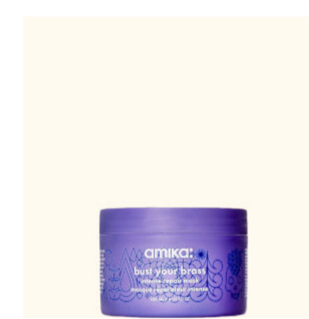
AMIKA BUST YOUR BRASS COOL BLONDE INTENSE REPAIR HAIR MASK - 250ML