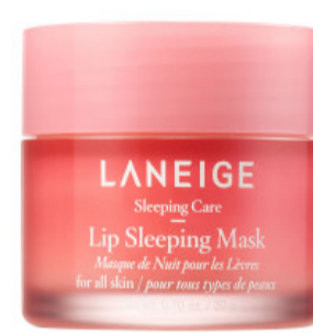
LANEIGE LIP SLEEPING MASK