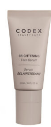
CODEX BEAUTY ANTU BRIGHTENING SERUM 30ML