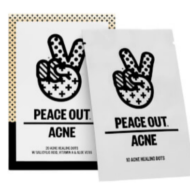
PEACE OUT ACNE HEALING DOTS