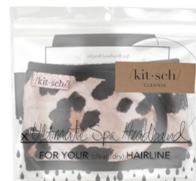
KITSCH MICROFIBER SPA HEADBAND (VARIOUS COLOURS)