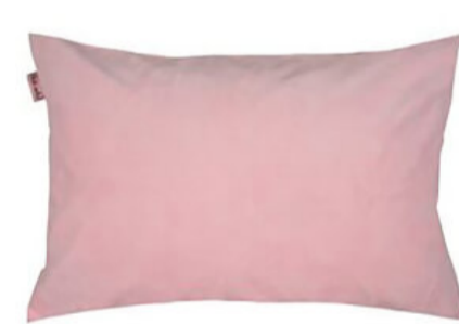
KITSCH TOWEL PILLOW COVER