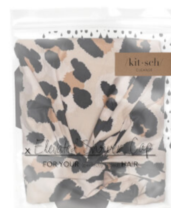
KITSCH LUXE SHOWER CAP (VARIOUS COLOURS)