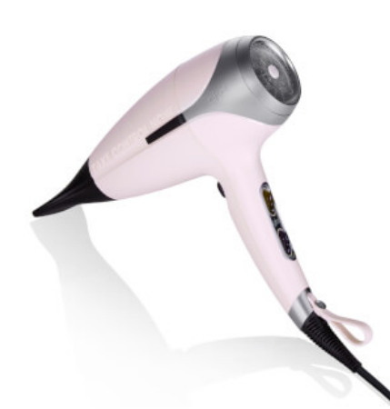
GHD HELIOS HAIR DRYER PINK COLLECTION