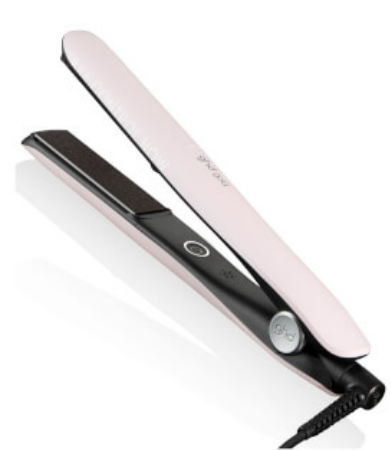
GHD GOLD® STYLER PINK COLLECTION