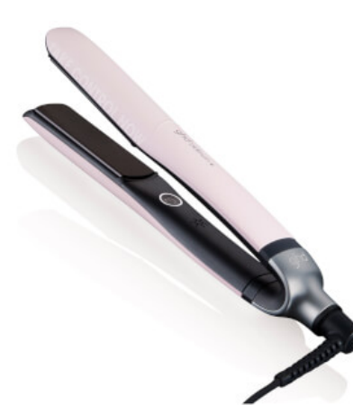
GHD PLATINUM+ STYLER PINK COLLECTION