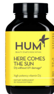
HUM NUTRITION HERE COMES THE SUN 30 CAPSULES