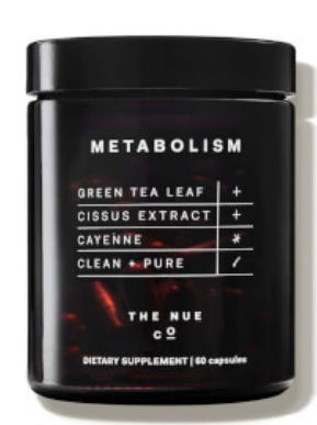
THE NUE CO. METABOLISM CAPSULES