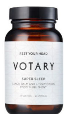
VOTARY SUPER SLEEP RELAX AND SLEEP SUPPLEMENT CAPSULES