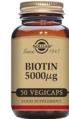
SOLGAR BIOTIN 5000MG VEGETABLE CAPSULES