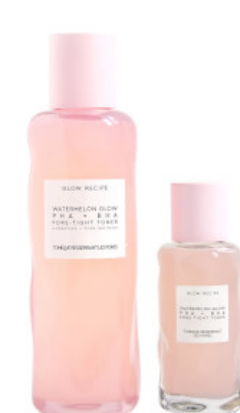
GLOW RECIPE WATERMELON GLOW PHA + BHA PORE-TIGHT TONER HOME & AWAY KIT