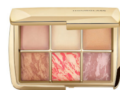
HOURLASS AMBIENT LIGHTING EDIT - SCULPTURE