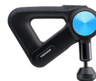
THERAGUN THERAGUN PRO