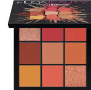
HUDA BEAUTY CORAL OBSESSIONS PALETTE