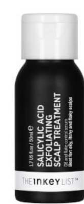
THE INKEY LIST SALICYLIC ACID EXFOLIATING SCALP TREATMENT 50ML