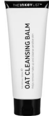
THE INKEY LIST OAT CLEANSING BALM 100ML