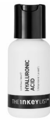
THE INKEY LIST HYALURONIC ACID SERUM 30ML