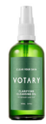
Votary Clarifying Cleansing Oil - Rosemary and Oat