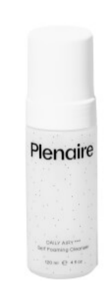
Plenaire Daily Airy Face Foam