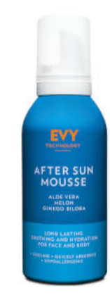
Evy Technology AfterSun Mousse