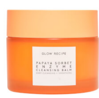
Glow Recipe Papaya Sorbet Enzyme Cleansing Balm