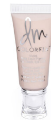
DANESSA MYRICKS BEAUTY COLOREFIX 24 HOUR CREAM COLOUR -NUDES