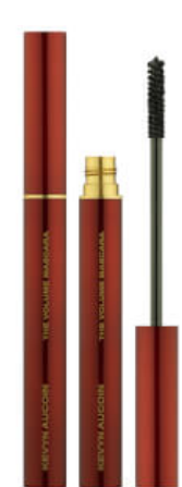
KEVYN AUCCOIN THE VOLUME MASCARA RICH PITCH BLACK