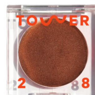
TOWER 28 BEAUTY BRONZINO ILLUMINATING CREAM BRONZER