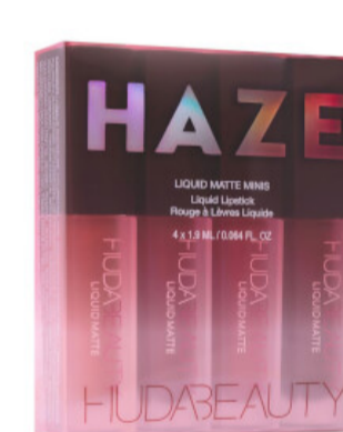
HUDA BEAUTY HAZE MINI LIQUID MATTE KIT