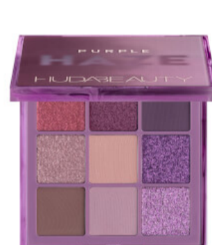
HUDA BEAUTY PURPLE HAZE OBSESSIONS