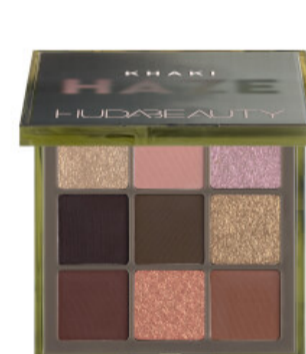
HUDA BEAUTY KHAKI HAZE OBSESSIONS