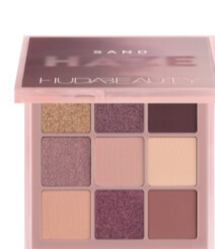
HUDA BEAUTY SAND HAZE OBSESSIONS