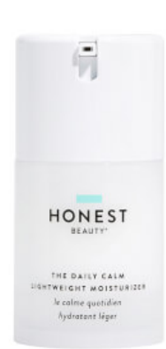
HONEST BEAUTY THE DAILY CALM LIGHTWEIGHT MOISTURIZER