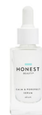
HONEST BEAUTY CALM & POREFFECT SERUM