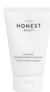
HONEST BEAUTY CALM ON FOAMING CREAM CLEANSER