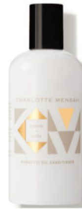
CHARLOTTE MENSAH MANKETTI OIL CONDITIONER 350 ML