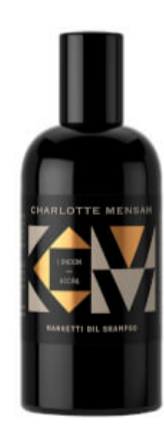
CHARLOTTE MENSAH MANKETTI OIL SHAMPOO