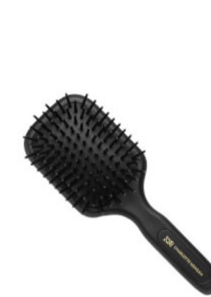
CHARLOTTE MENSAH PADDLE BRUSH BLACK